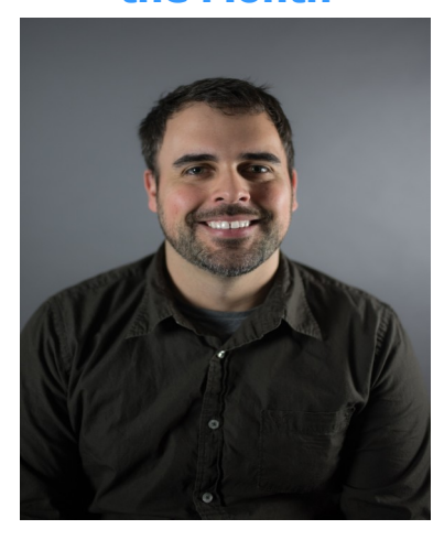
Employee of the Month